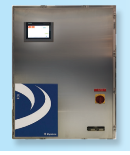
Dynisco's RCU Ultimate Performance

Combines rheological properties of a Laboratory Capillary Rheometer with MFI readings delivered by a Melt Flow Indexer